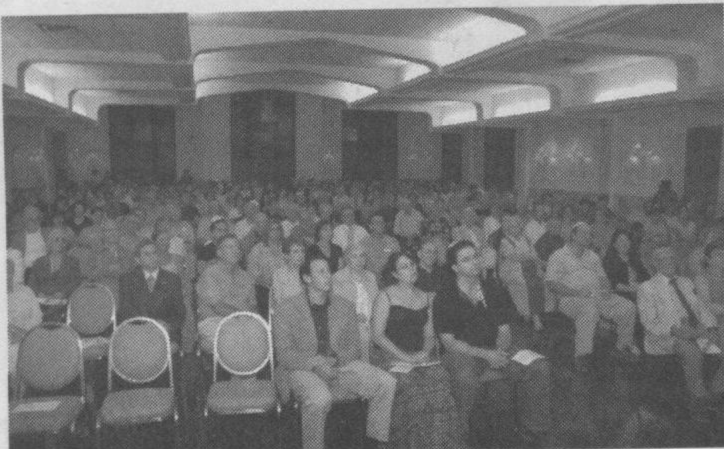
More than 400 people at Beth El in support of Israel